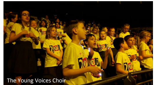
The Young Voices Choir